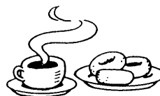
Coffee and Donuts

OUR PRAYER CHAIN LINE- You can call Audrey at 878-7125 or Renee at 532-7008. They will contact others who have committed to praying for your loved one.