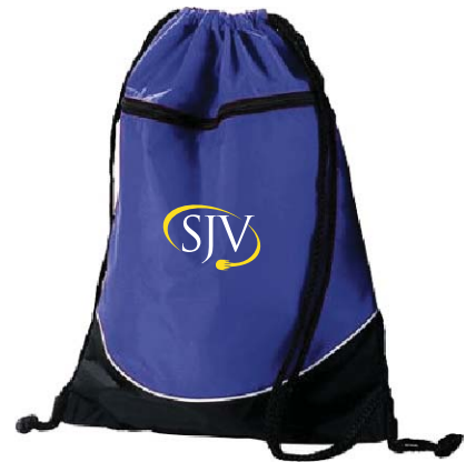
STYLE 1920 - TRI-COLOR GYM SLING Embroidered SJV Logo $14.00