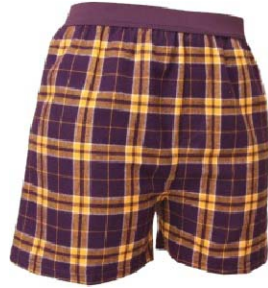
Purple/Gold Flannel Boxer (F44PG-2) Embroidered SJV Logo $16.00