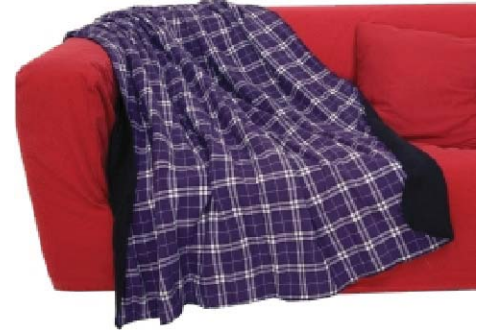
Purple/White Flannel Blanket (FB150PW-2) Embroidered SJV Logo $23.00

Features a covered elastic waistband with imprintable taping, longer length, and roomy cut. Constructed from super-soft 4oz 100% cotton flannel. Sized Adult S-XXL and Youth YS-YL. Unisex Fit.