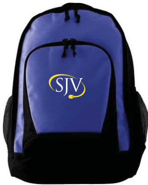
STYLE 1710 - RIPSTOP BACKPACK Embroidered SJV Logo $22.00

(Please NOTE: YS-AM Plenty sizes Available) (For Adult Lrg and up please Call 616-915-8773 for Availability)