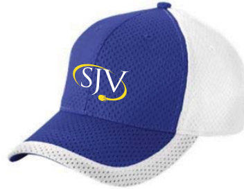
STYLE 6245 Adult STYLE 6246 Youth $12.00