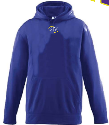
STYLE 5505 - FANATIC HOODED SWEATSHIRT Embroidered SJV logo