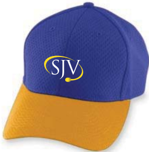
STYLE 6235 Adult STYLE 6236 Youth $12.00