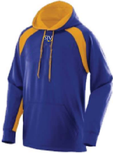
STYLE 5527 - FANATIC HOODED SWEATSHIRT Embroidered SJV logo