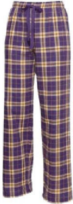
Purple/Gold Flannel Pant (F19PG-2) Embroidered SJV Logo $20.00