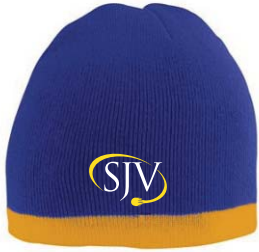
STYLE 6820 $12.00